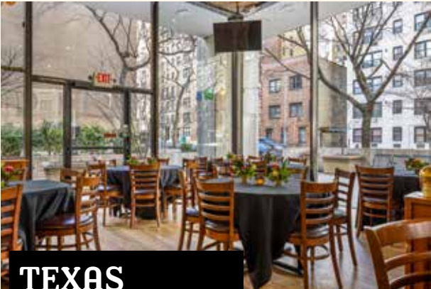
TEXAS Cocktail party: 80 standing Seated meal: 55 seated