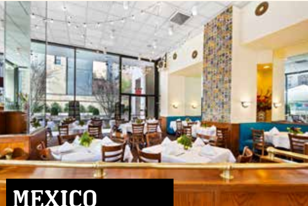
MEXICO Cocktail party: 150 standing Seated meal: 80 seated