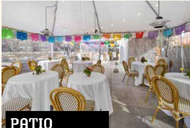
PATIO Cocktail party: 50 standing Seated meal: 40 seated